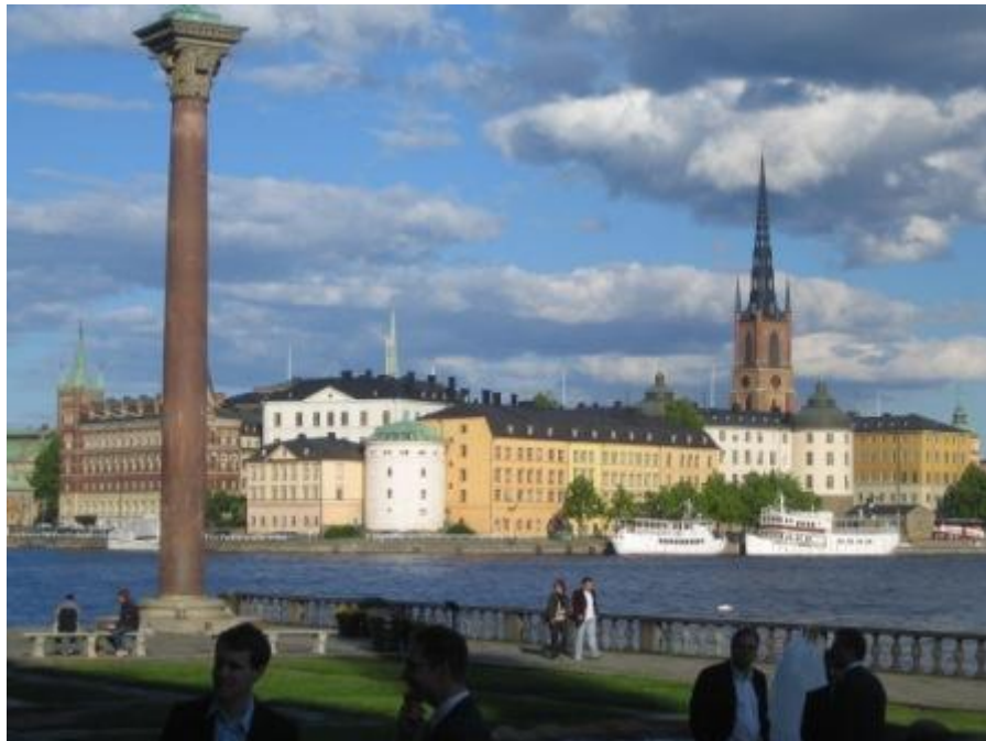
View from Stockholm City Hall, site of the conference banquet.