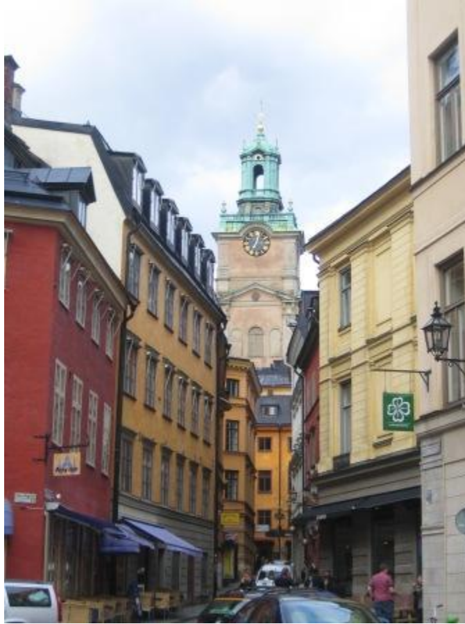
One view of Gamla Stan.